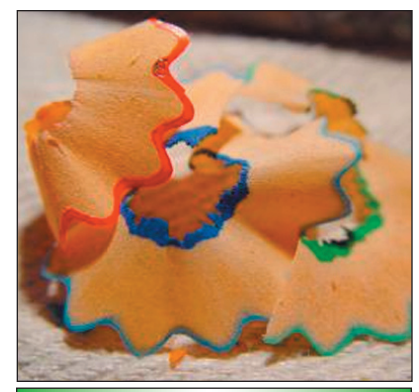
There is much involved with running a school.

There is also the need for a cafeteria to serve meals, kitchen workers to prepare the food and refrigerators to store the food. There are principals, school boards, superintendents and others to help to manage and plan for all that occurs at school. All these things and many more are required in order to run a school.