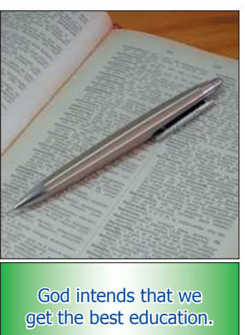
II. Memory Verse.

Children should try to realize how much they need their teachers and their school. Getting a good education is an essential part of their lives. They should do whatever they can to get the best education. This will have a great impact on a child's future. God has prepared the way for each child to get a good education. Children should cooperate and be thankful.